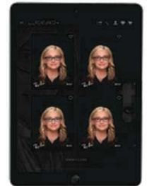
Find frames Thousands of styles rendered instantly in 3D

You have a realistic way to try on glasses digitally: