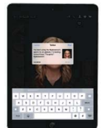
Share on Social Media Get the opinions of family friends